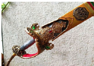
"Jagdamba", the sword of Chhatrapati Shivaji Maharaj, which is under the purview of British Royal Family in London.

It is time that Discrete Mathematics is included in school curricula starting from Class 6 onwards with a focus on graph theory, combinatorics, number theory, discrete geometry, and discrete probability. These modules will also help students who are not particularly strong in arithmetic or algebra to understand the concepts more easily.